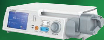
Semi - 1