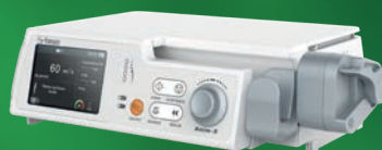
Anim - 5