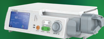
Erch - 3